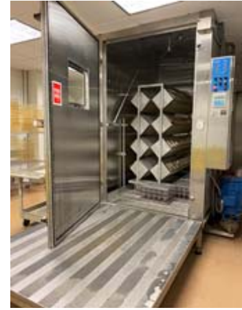
Caging Racks and Cash Washer

The animal facility is managed and maintained by a Vivarium Manager and staff, with support from research investigators. Oversight of the facility and program is through an Institutional Animal Care and Use Committee (IACUC) and one on-call veterinarian.