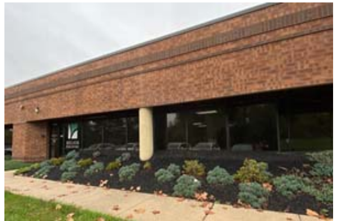
Outside View of the Facility

Melior moved to this site in June 2006. At the time it was only a 8,116-sq. ft. facility. Prior to that, the building was mostly unfinished shell space, that Melior specifically customized for its use. In 2008, Melior expanded into an additional 5,394-sq.ft. of space. In November 2020 the Company added an additional 4,689 sq.ft. In January 2023 the Company added an additional 3,895 sq. ft.